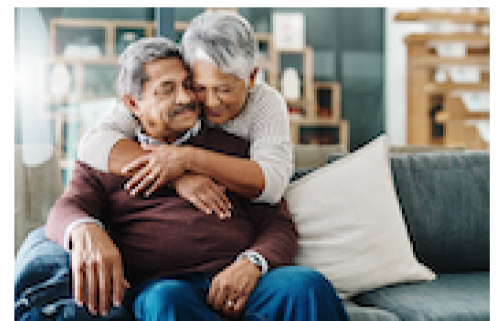
Celebrity News Puts Aphasia in the Spotlight