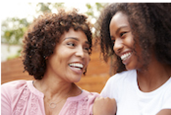
Removing Gender Bias from Health Care